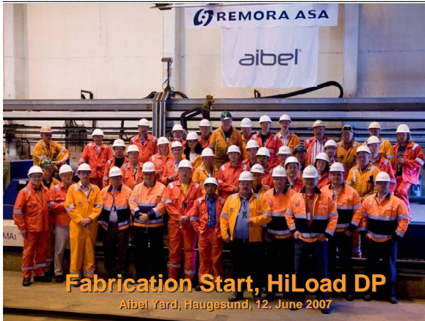
Remora and Aibels team